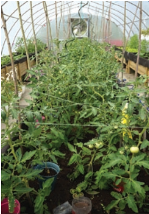
Vegetables grown during the Greenhouse/ Garden Workplace Training program

Our work includes designing and facilitating community-wide workshops, working closely with job coaches and the cultural support team to assist in Literacy and Essential Skills (LES) development, and assisting the project team in a number of other ways.