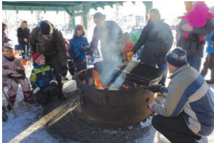
Families enjoying the free outdoor hotdog roast

The event was tremendous fun, and YLC continues to receive positive feedback from community members.