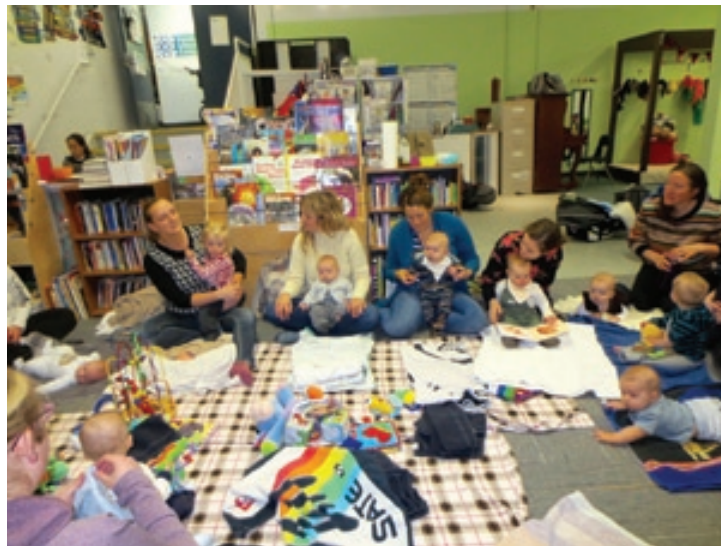
'Baby Senses' program on a Tuesday morning at the Family Literacy Centre

The number of community groups and organizations using the FLC continues to grow as we reach further out into the community. Our space is highly valued by all who use it. User groups appreciate access to the space for their learning events, and we often collaborate with organizations throughout the community to share our skills.